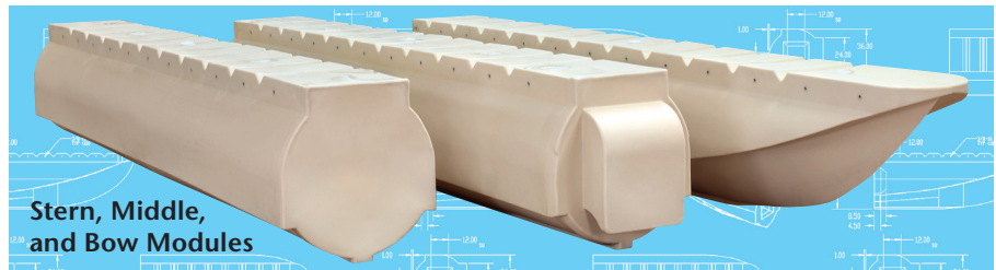
Stern, Middle, and Bow Modules