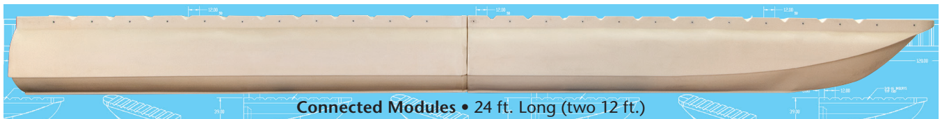
Connected Modules • 24 ft. Long (two 12 ft.)